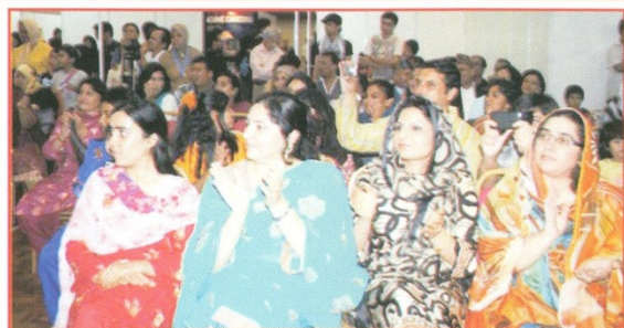
Weekly Pakistan Times Malaysia