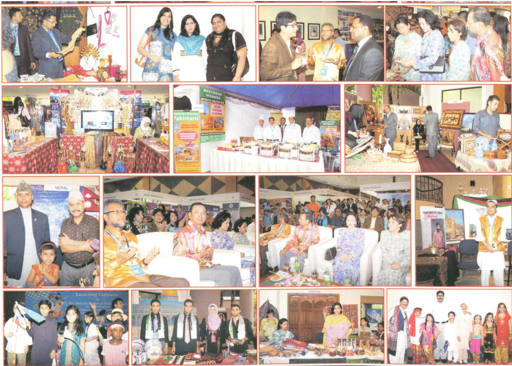
Weekly Pakistan Times Malaysia